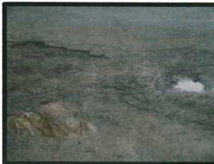
Damaged parking areas