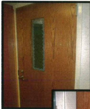
Old doors & hardware